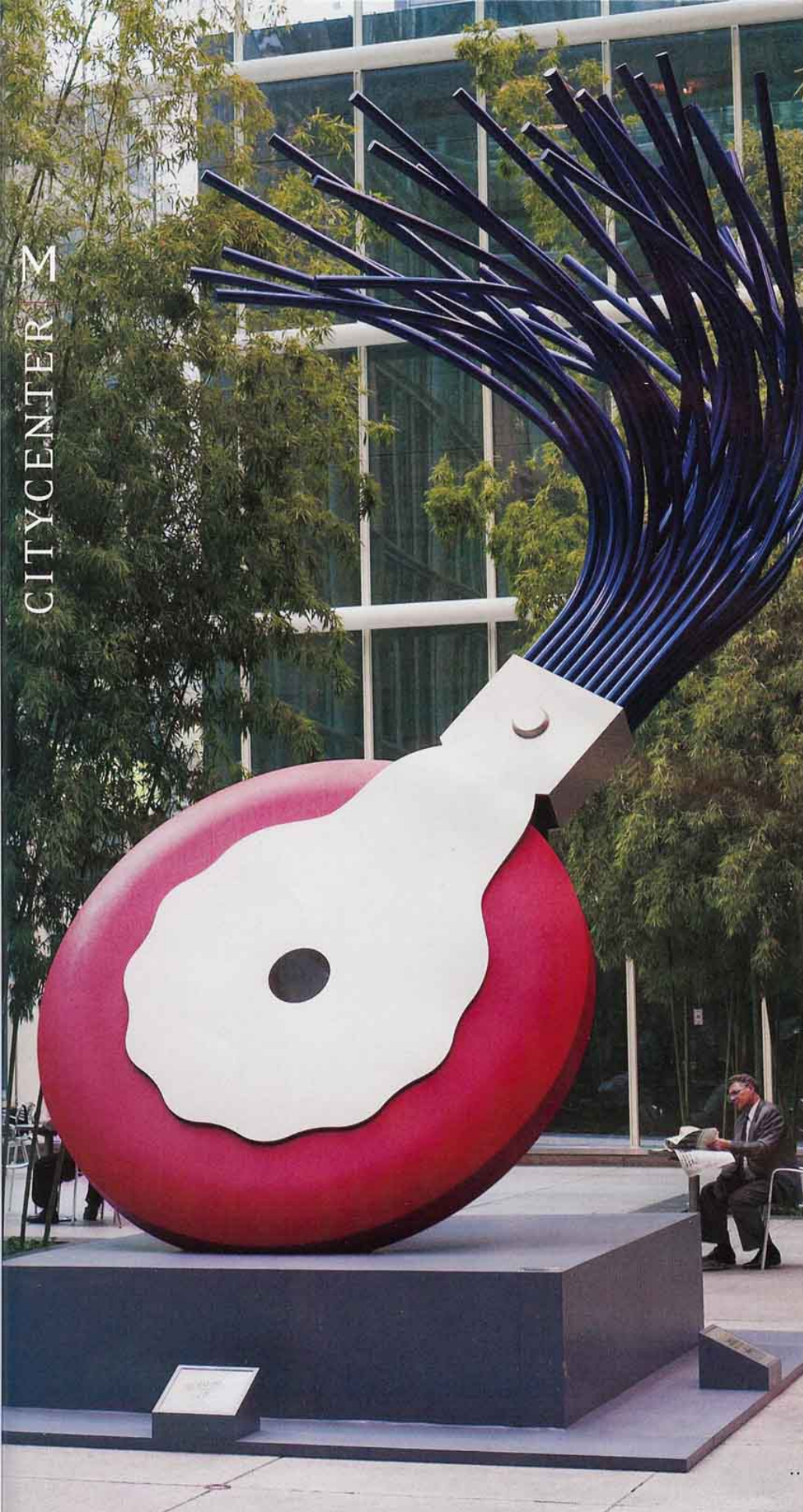
Copyright 1998-99 © by Claes Oldenburg and Coosje van Bruggen